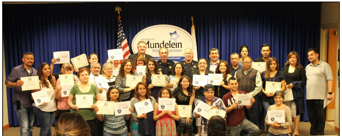
Mundelein (IL) Police Department Spring Latino Class