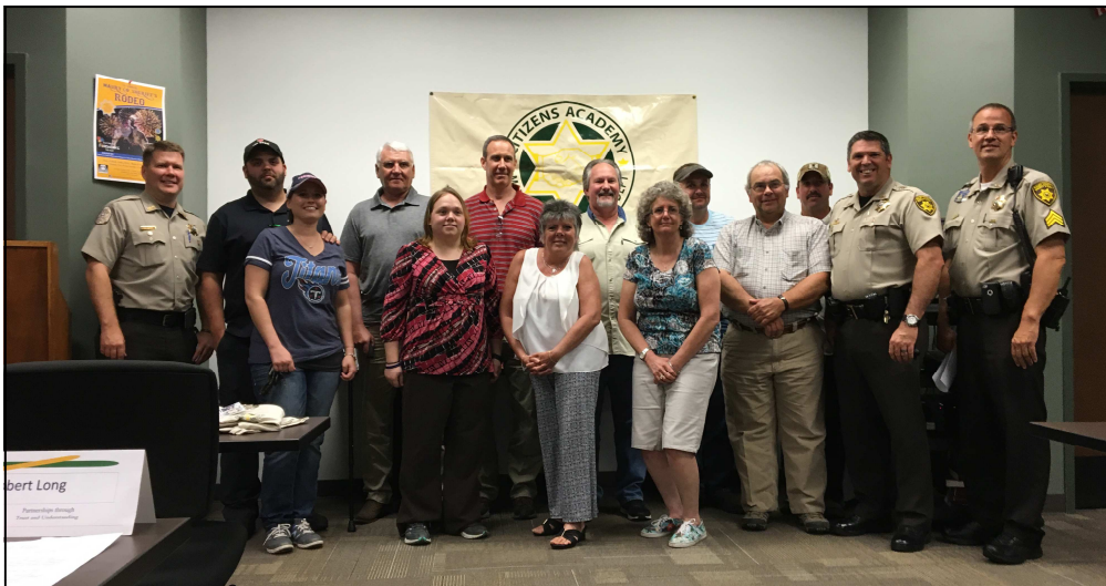
Maury County (TN) Sheriff's Department Class 12