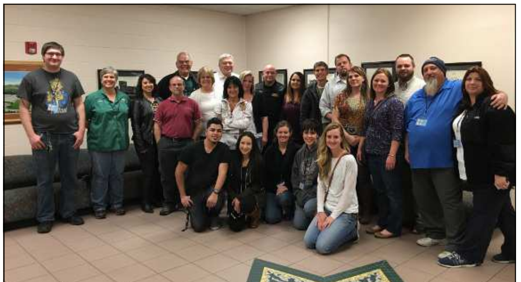
West Jordan (UT) Class Spring 2016