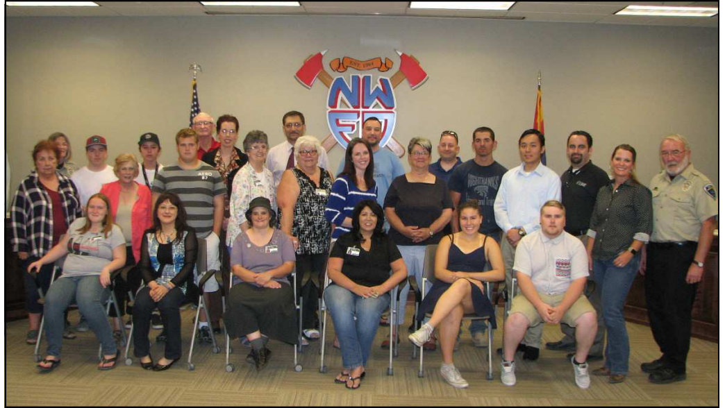
Marana (AZ) Police Department Class 16-1