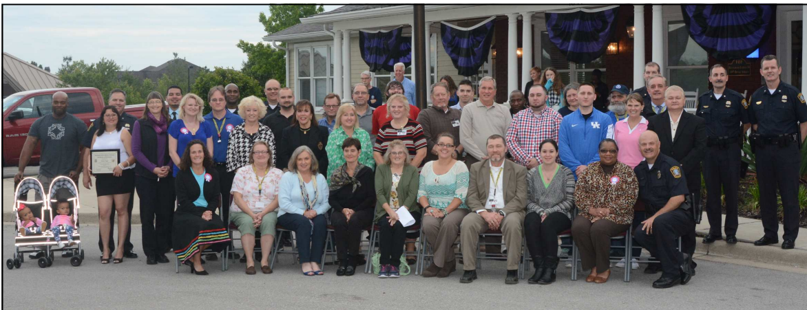
Lexington (KY) Police Department Class 55