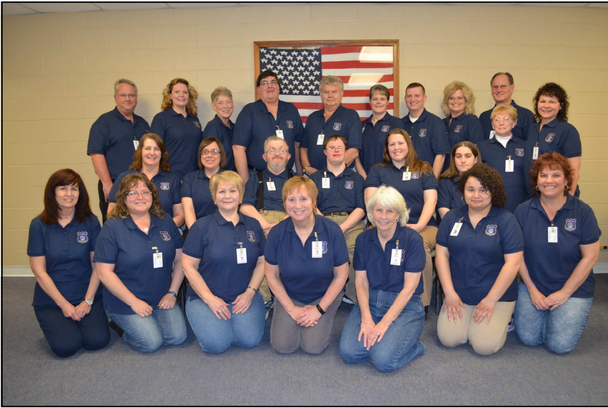
Bellefontaine (OH) Police Department Class 4